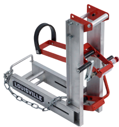
1 Aluminum Pump Jack LPB01