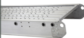
11 Nestable Stages L-P2 Series