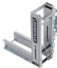
7 Aluminum Work Bench LPB08