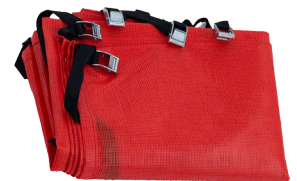
8 Safety Net LPB09