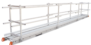
9 Modular Guard Rail System*