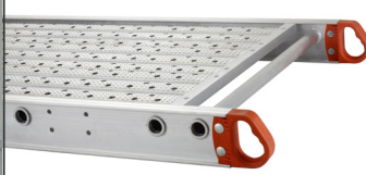
10 Aluminum Plank P Series